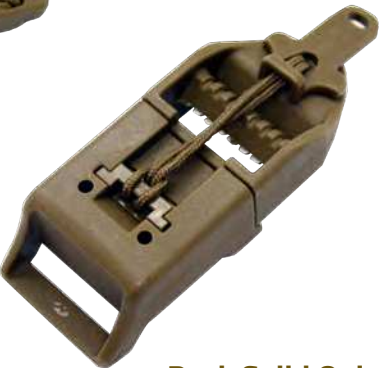
Rock Solid Quick Release Tensionlock with quick assembly to be used on backpack shoulder straps.