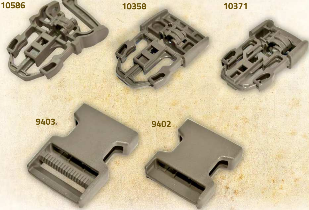
For use with 10358 and 10586 only