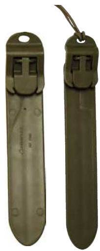
5" cord 10232 w/o cord 10446