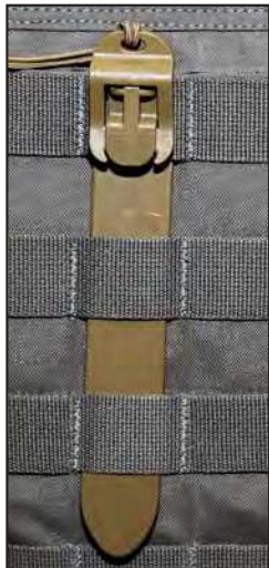
6" cord 10298 w/o cord 10191